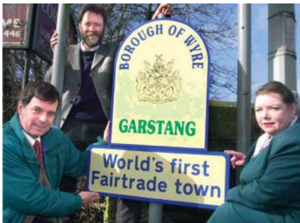
Garstang in Lancashire, UK, world's first Fair Trade Town, November 2001.

The municipality of Traun (23.000 inhabitants) was the winner of the second category. Traun is indeed very active in awareness-raising around the topic of Fair Trade. In particular, it won the award, because it bought Fair Trade Polo T-Shirts to dress three out of four of its staff members. The Jury welcomed this very significant engagement, given the size and possibilities of the municipality.