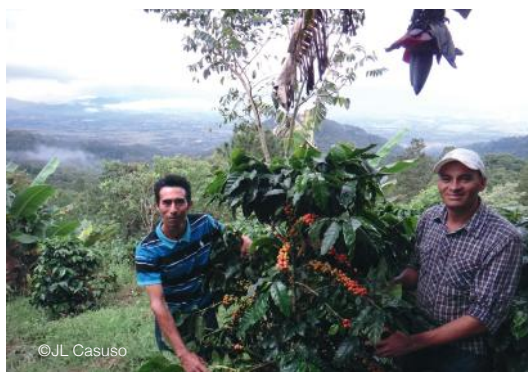
Working at CONACADO, Dominican Republic

Fair Trade is a very new concept in the Philippines. Awareness is still very low. However, local government have been carrying out some of the Fair Trade principles. In particular, each province, city and municipality in the Philippines annually celebrate a festival to help local craftsmen and producers to directly sell their goods to consumers. Often, this is also where they meet foreign traders who will eventually export their products. In the Bicol Region (south of Manila), they have an activity dubbed as "Meeting people behind the products" which combines tourism with local production creating links between producers and consumers. This initiative enables consumers, including tourists, to gain understanding on the social and environmental costs of their consumption. This likewise exerts pressure on producers and traders to provide safe and healthy working conditions for the workers.