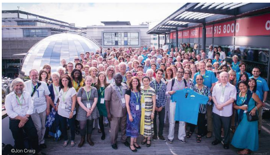
9th International Fair Trade Towns Conference, 2015