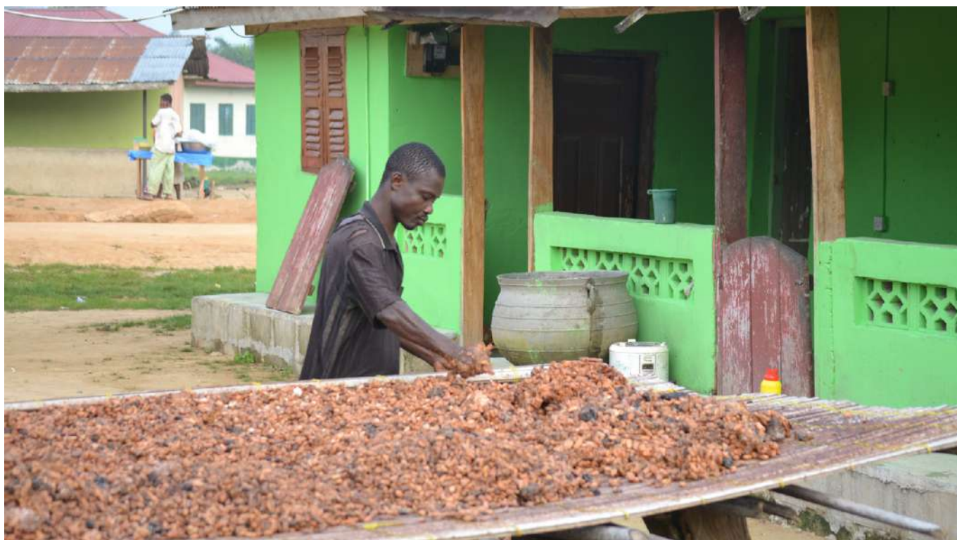
Laying cocoa beans to dry in the sun, Homaho village, Assin district, Ghana

should be revised to ensure it supports sustainable cocoa production. Good communication and/or participation in or between the producer country and EU forums is critical. 12