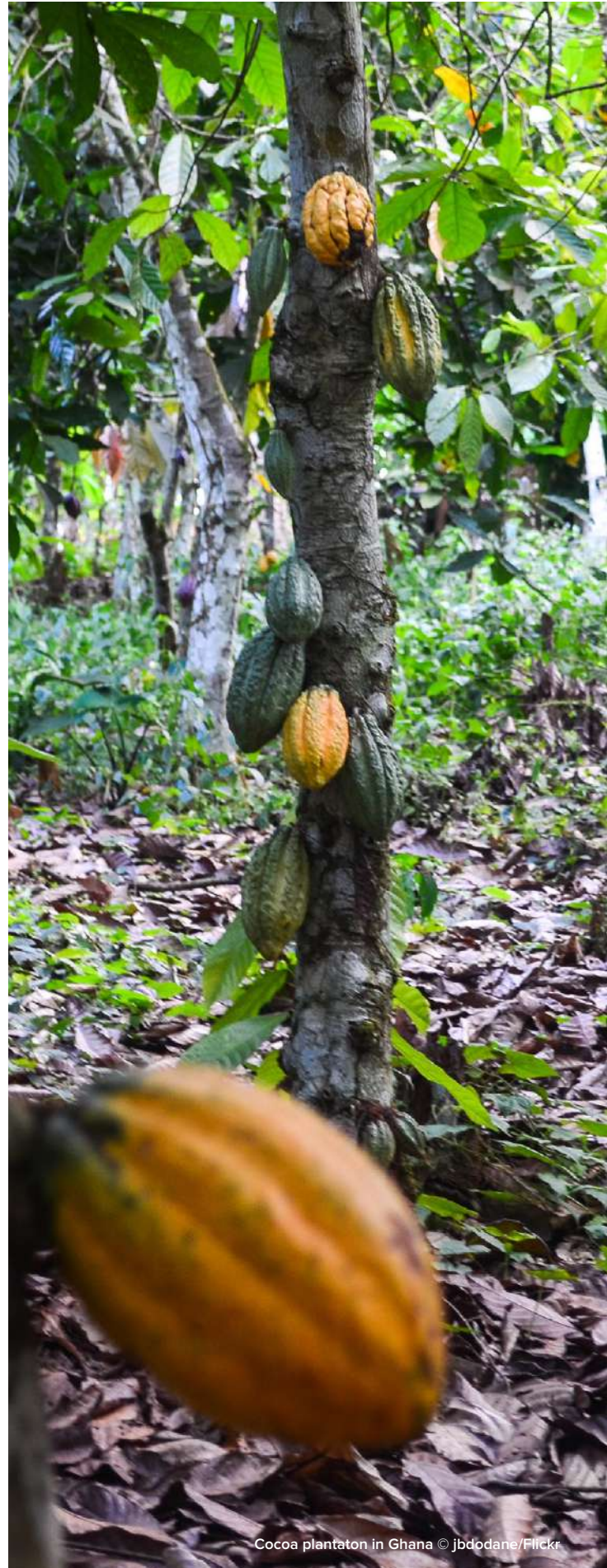
Cocoa plantation in Ghana