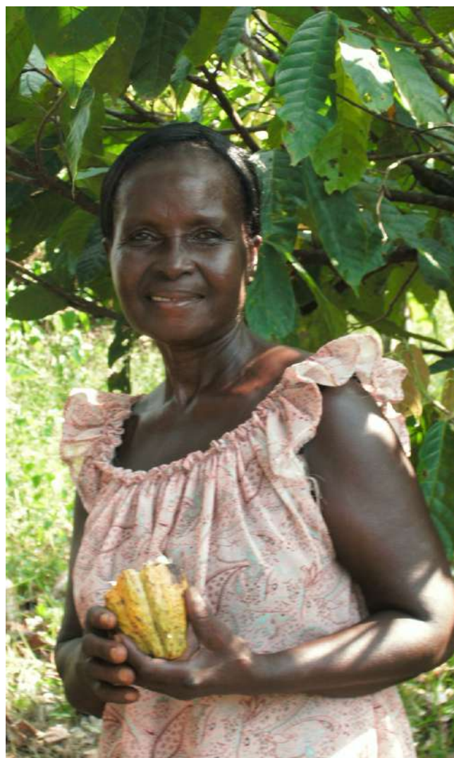
Productrice de cacao - Côte d'Ivoire

Recognised land ownership not only provides rights to farmland and the profits from the harvest but also visibility, access to cooperative membership, agricultural extension, inputs, training, premium payments and credit. Those women not able to hold land titles, tend to remain outside cooperatives or producers' organisations and therefore miss out on extension services and other programmes targeting organised farmers. Even where women own land, they are likely to face greater constraints than their male