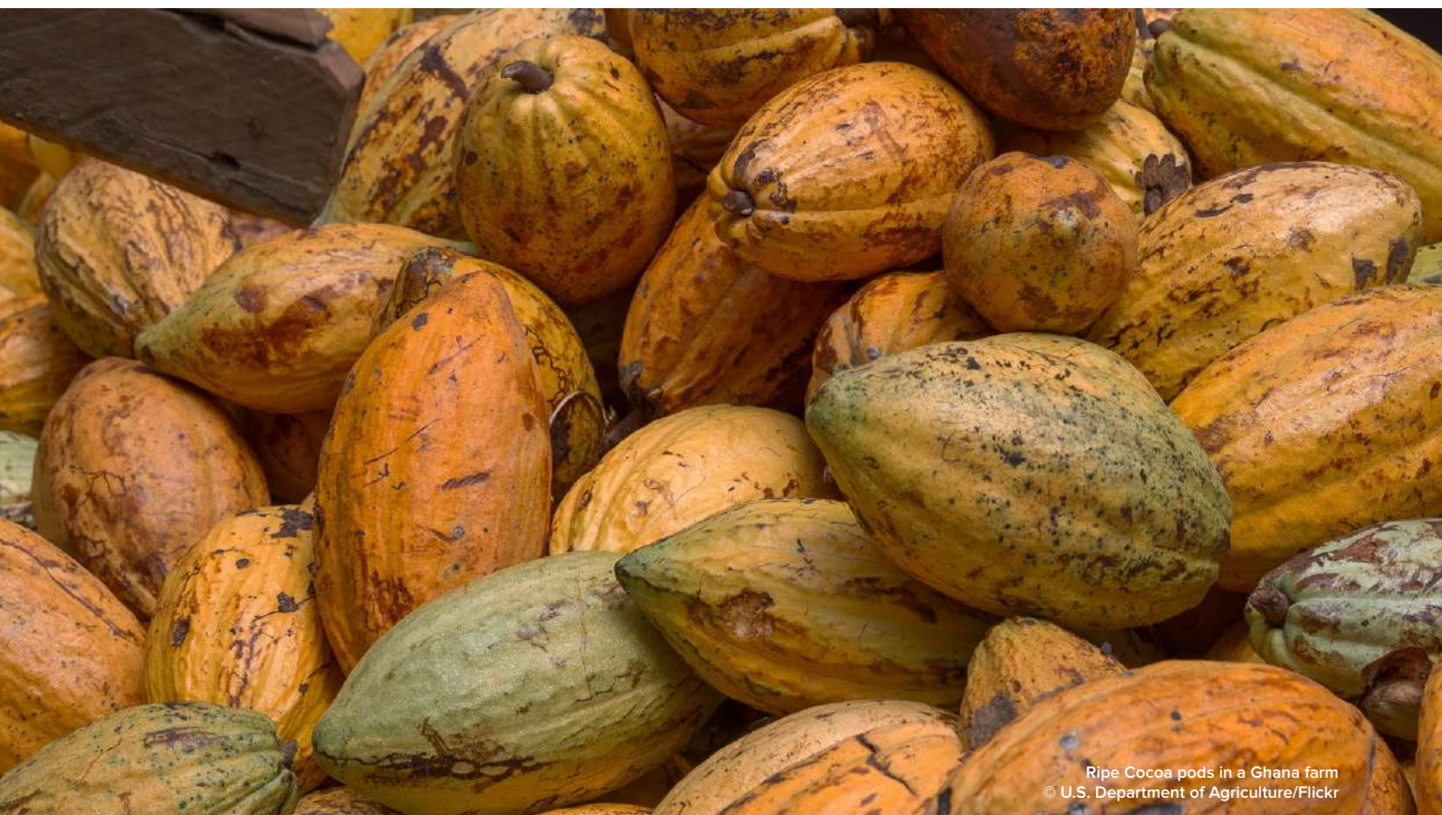
Ripe Cocoa pods in a Ghana farm

We would like to thank all of the individuals and organisations who have helped draft this discussion paper, including Rainforest Alliance and Fairtrade International who contributed to various sections.