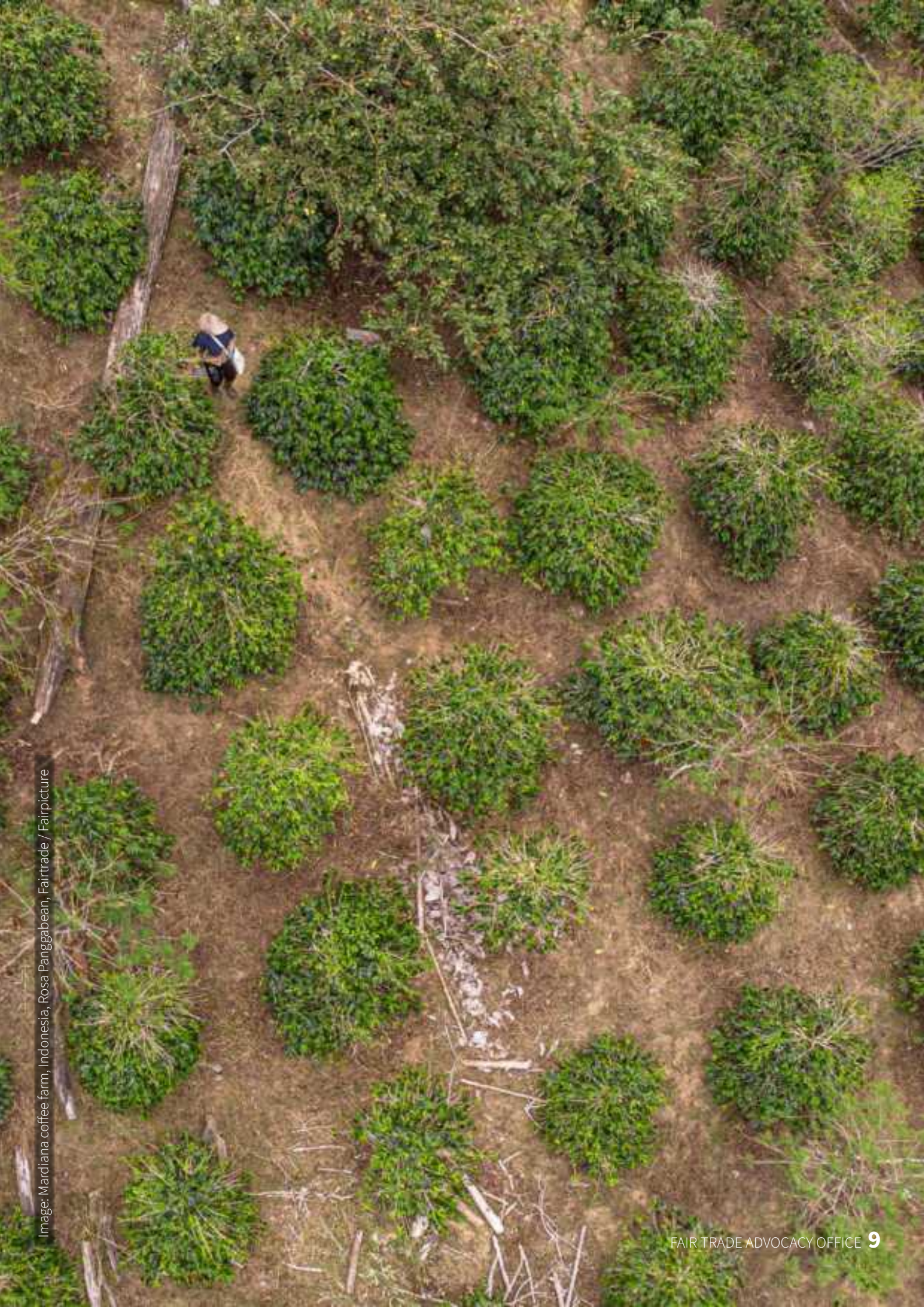
Image: Mardiana coffee farm, Indonesia