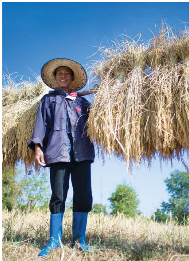
Growing organic jasmine rice in Thailand

studies, particularly a Friends of the Earth study 34 , find many weaknesses in the implementation in the first year and argue that companies and governments must do better. Further, the report finds that most companies whose French Duty of Vigilance law reporting was analysed, are just reporting on the DD methods, not the DD results 35 . For example, the UK MSA has served as a catalyst for corporate awareness regarding abuses in supply chains and several companies have responded positively by developing policies and procedures to address risks. However, these are still very much at a superficial level, addressing mostly tier one suppliers and focusing on process rather than results of due diligence 36 .