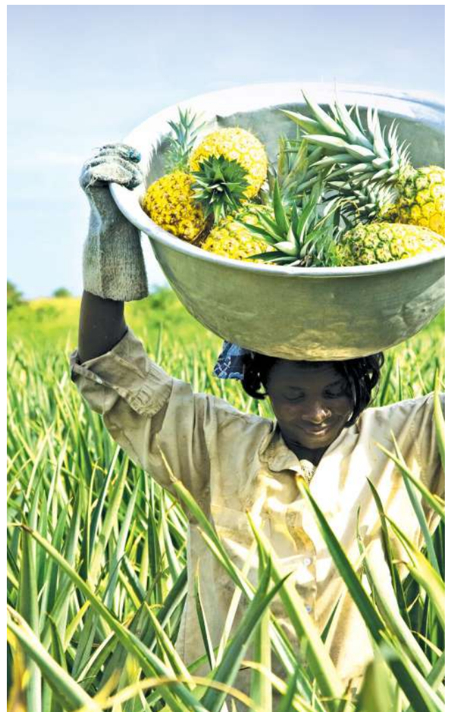
Harvesting pineapples in Ghana | Photo: Nathalie Bertrams

result of the competitive dynamics involved 42 , while there are actions by some leading companies, many global companies have responded to voluntary HRDD frameworks by taking a minimal, tick-box approach 43 . Mandatory HRDD frameworks – particularly those with civil liability – may also encourage companies to do the bare legal minimum, and to publish as little as possible, i.e. there are potential perverse effects from the more rigorous legislation 44 . In the main, according to a majority of interviews, HRDD exists more on paper than in practice; is more 'tick-box than meaningful'; conceals as much as it reveals; and falls well short of UNGP expectations. 45 Shift's (2019) recent analysis of 20 large French companies, points to some improvements in areas of reporting, but the poor reporting on actions and grievance systems, would also suggest that there is limited, systematic change in practice within companies to date.