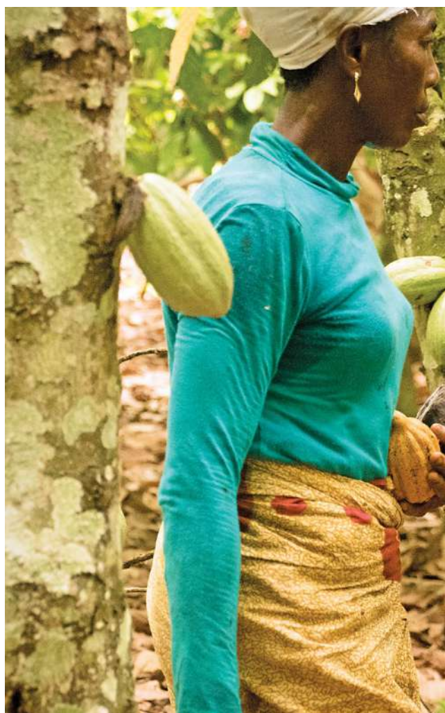
Cocoa farming in Ghana

In one mining case in the DRC where companies rapidly withdrew with major negative consequences for the local population and their livelihoods 90 .