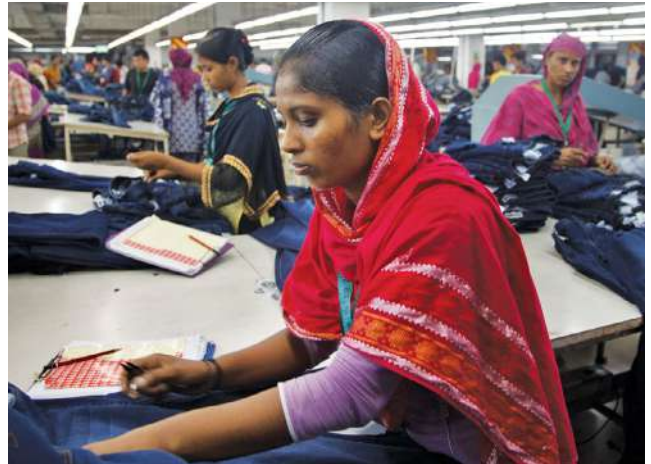
Apparel factory in Bangladesh

receiving donor support, recently concluded that, despite positive individual cases of corporate change (often qualitative success stories, rather than robust qualitative or quantitative evidence), there is a dearth of evidence to demonstrate positive effectiveness and impact at wider scales (e.g. company-wide, sector, industry) and wider trends suggest that voluntary measures alone are insufficient at best, and at worse, enabling abuses and environmental damage to continue 19 .