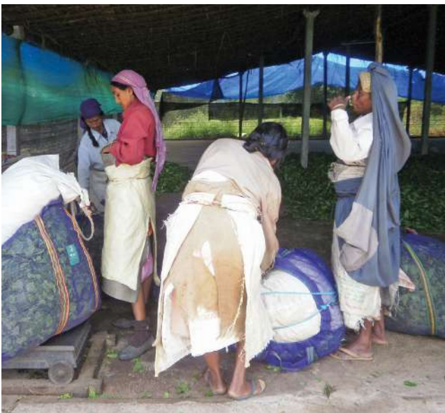
Weighing picked tea leaves in India

While enforcement of monitoring and compliance systems are seen as important, there is insufficient detail on how this should be achieved.