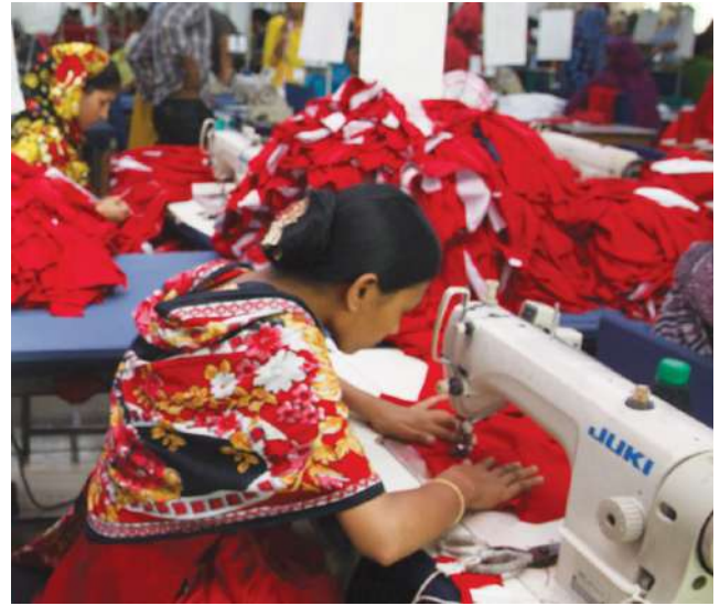
Sewing garments in a factory, Dhaka, Bangladesh

changes. This indicates that critical assumptions in the theory of change may be at risk, and it is uncertain whether HRDD frameworks can be effective mechanisms, in the absence of meaningful home and host government action.