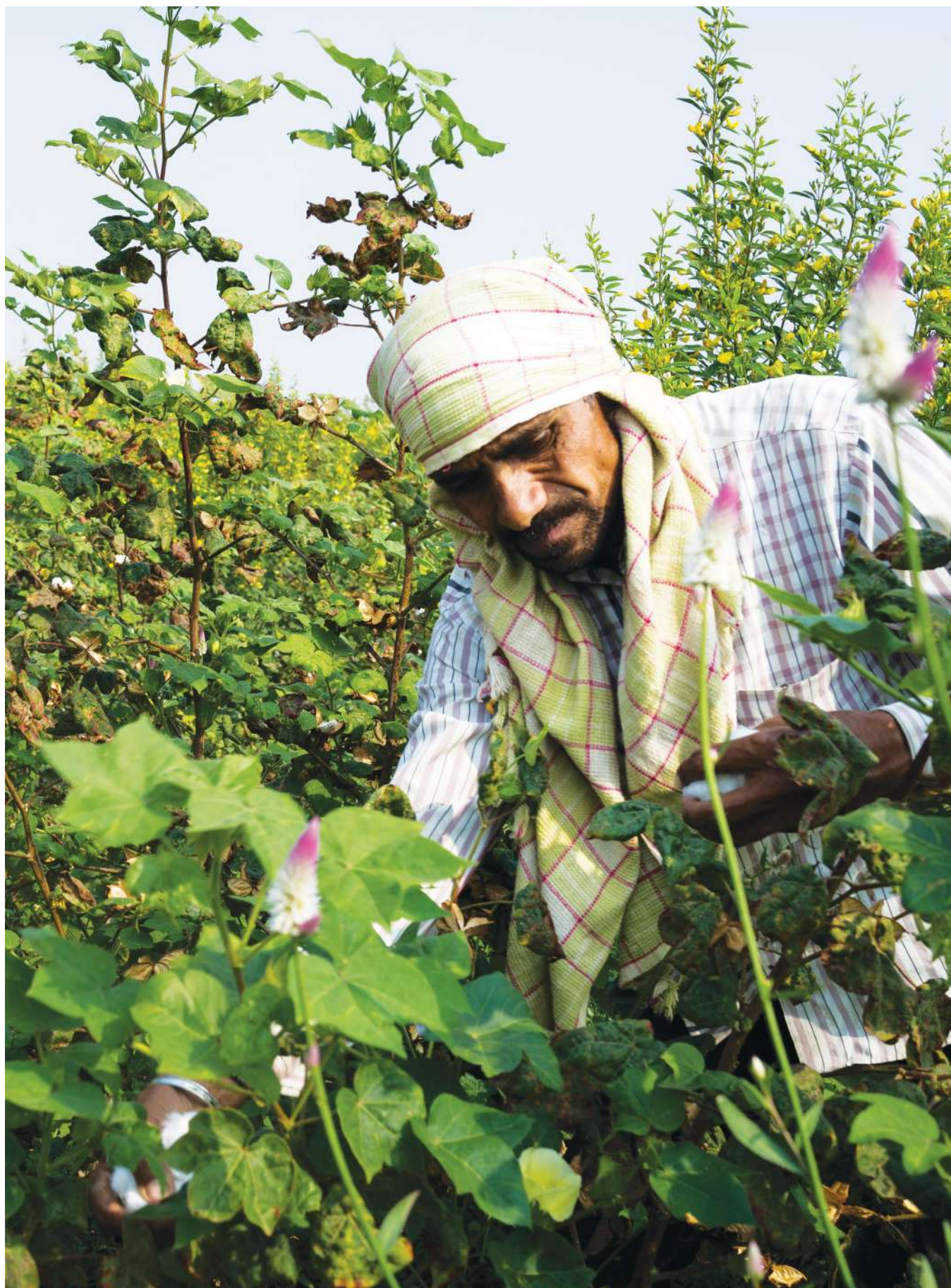
Picking cotton in India | Photo: Florie Marion