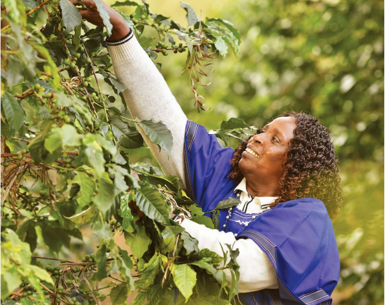
Coffee farming in Kenya