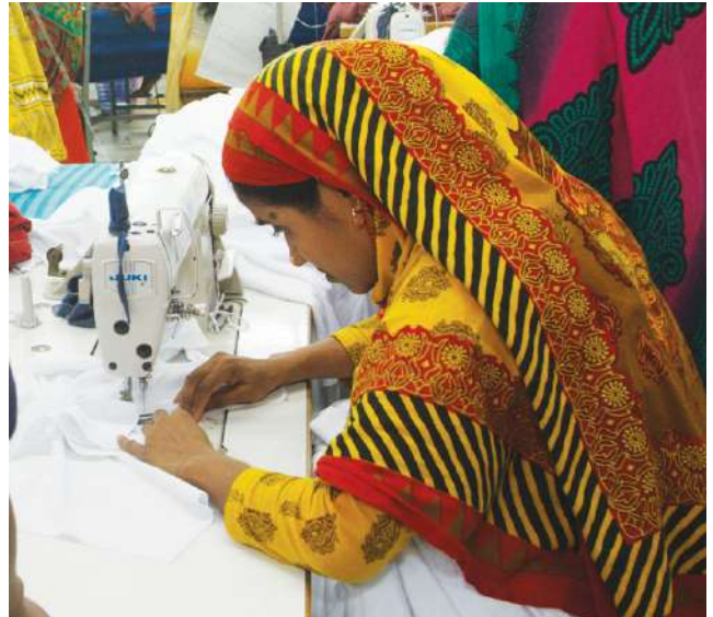
Garment factory in Bangladesh

pressure and/or reduced incomes. In the garment industry the poor sourcing and purchasing practices of brands and retailers are a prevalent root cause that incentivise workplace abuses in supplier factories and heighten brands' exposure to human rights risks 100 . As recognised by the EU Directive on the matter, unfair trading practices are especially problematic in the food supply chain where they can threaten the survival of smaller food producers 101 .