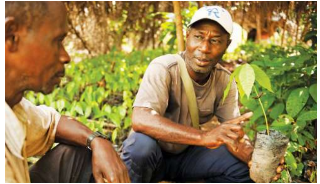
Cocoa growing in Ivory Coast

labour law only requires that the company has done what can reasonably be expected to prevent child labour. The extent to which preventative action plans are required to include adequate remediation is yet to be defined.