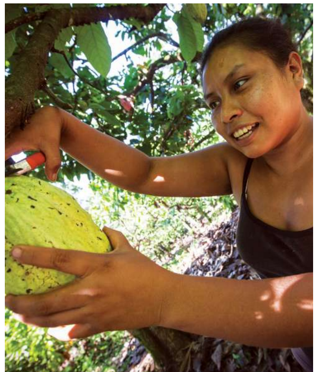
Cocoa farming in Nicaragua