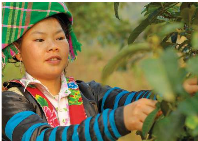
Picking tea in Vietnam

its link to illegal armed groups, not whether their extraction and trade has involved human rights violations. However, in the case of conflict minerals, a very specific link is also made with violent abuses, including gender-based violence, in the context of armed conflict as part of the rationale for instituting these measures.