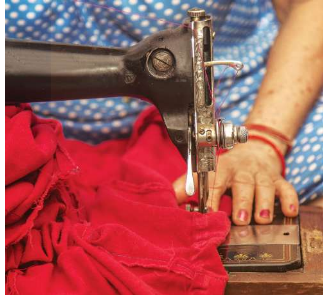
Sewing garments

The validity and risks of using public funds to help companies to implement HRDD are uncertain.