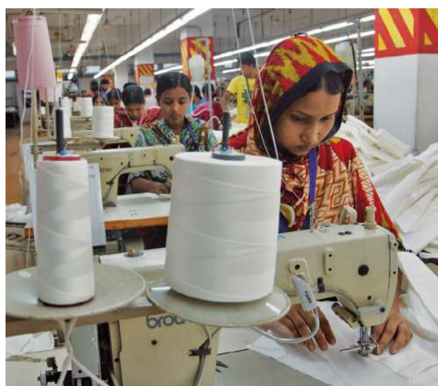
Workers in ready-made garments, Bangladesh

Existing HRDD guidance, in particular the OECD general and sectoral guidance 135 , already contains mention of responsible purchasing practices and systemic risks. However, without explicit references that responsible trading practices need to consider and guarantee living wages and living incomes for workers and farmers this would not be enough. Experience by some leading companies suggests that better purchasing practices are a necessary rather than sufficient condition. The coexistence of both commitments to 136 , and some evidence of, better purchasing practices with the continued payment of wages that are not living wages 137 , and low prices that do not provide a living income, suggests that an indirect approach to living wages and living incomes via purchasing practices will be insufficient 138 . Better purchasing practices may help, but they are unlikely to be effective by themselves in leading to living wages or living incomes.