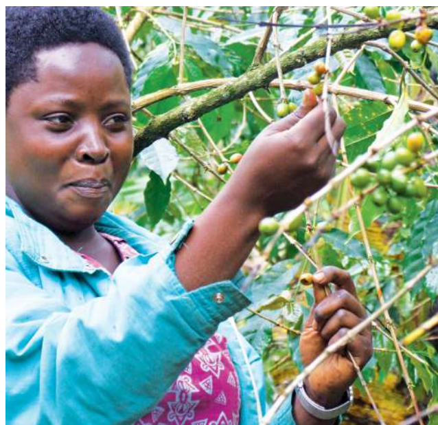
Coffee farming in Uganda

Women are disproportionately represented in the informal sector and have a high participation in agricultural production in a context of policies which are not sufficiently gender sensitive. The impacts of business are gendered, because of pre-existing social norms and patriarchal relations, which also make accessing redress more difficult for women who face additional barriers. The OECD (2018) 82 states that ‘ business should recognize the ‘different risks that may be faced by women and men’ and ‘be aware of gender issues and women’s human rights in situations where women may be disproportionately impacted’ . Drawing upon evidence from work in global supply chains and communities, ActionAid (March 2020, p14-