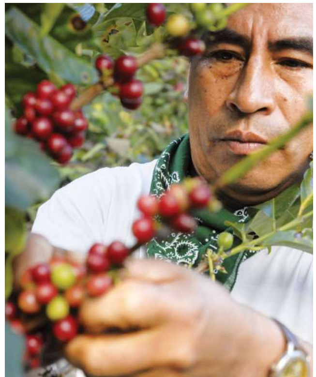
Coffee farming in Ecuador

These asymmetric power relations in agricultural and apparel value chains mean that suppliers are squeezed on price and pressured by unfair business practices. These pressures, and associated business risks, are often passed down the